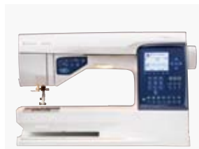
SAPHIRE™ 870 QUILT