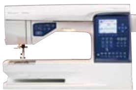
SAPPHIRE™ 870 QUILT