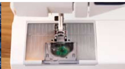
Extended dual stitch plate guide lines.