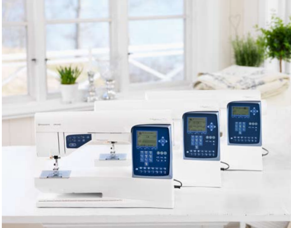
All three SAPPHIRE™ models are precision at its best! Superior European craftsmanship, quality precision workmanship, parts, and materials.

SET MENU Change preset machine settings, make manual adjustments to automa- tic functions and set personal preferences.