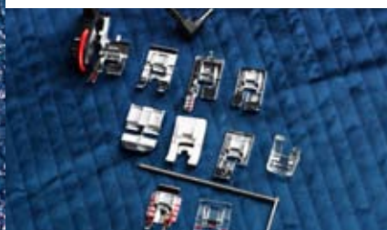
Includes snap-on presser feet and accessories to make it easy to sew special techniques.