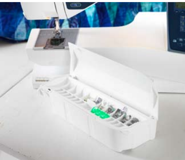
Slide on accessory tray. Convenient storage for all accessories. The lift out tray stores feet and bobbins.

SEE MORE FEATURES AND BENEFITS AT WWW.HUSQVARNAVIKING.COM